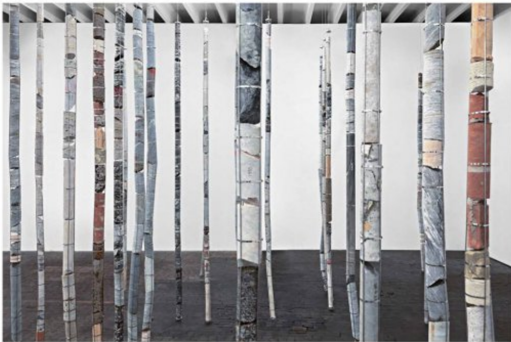
Chelsea Bonny Clockwork , 2014 Mixed media installation in collaboration with Julian van Buren, 13 meters across, three transparent models. Installation view at GEM, Vienna.