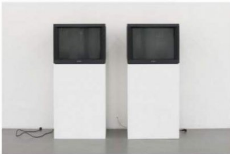
Pierre Bismuth, In prevention of technical malfunction – Unplugged Bruce Nauman video work , 2003.

Or maybe it all starts in 1979, when Sylvester Stallone stars as the eponymous boxer in the sequel Rocky II . The same year, Ruscha, with help from his friend Jim Canzer, make a large rock of resin and sand, titled Rocky II , which they then take cut to an undisclosed location in the desert surrounding Los Angeles, planting it among all the extant boulders in the area. It looks just like all the rocks around it. Nothing is written about the piece, it is never exhibited, and the only record of it is the BBC documentary.