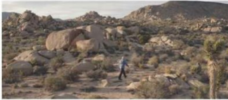
Pierre Bismuth, Where is Rocky II? , 2015.

Maybe it all starts in 2006, when a friend gives Bismuth a copy of a 1980 documentary on Ed Ruscha filmed by Geoffrey Haydon for the BBC's Seven Artists Series . The 28-minute film draws parallels between Ruscha's work and the Los Angeles landscape; documents Ruscha crafting a fake boulder, and films him taking it out into the desert.