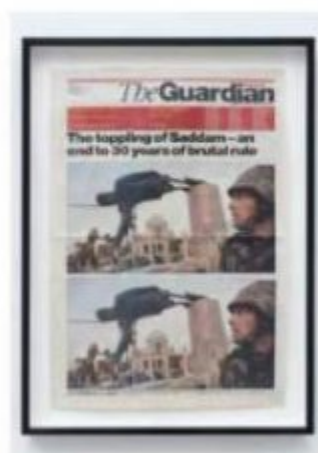
Pierre Bismuth, The Topping of Saddam (The Guardian - jeudi 10 avril 2003), 2003.

Bismuth ranks among the very few conceptual artists with Academy Awards. His work as a contemporary artist often utilizes other artists' works to serve as proxies by which he can destabilize our reading of cultural objects, drawing attention to constructs that we take for granted. This destabilization is effected by sometimes extremely simple gestures: for instance, his 2003 work To Prevent Technical Malfunctions (unplugged Bruce NAUMAN video) displays two blank, unplugged video monitors purportedly playing a Bruce Nauman video; a collaborative untitled video work with Cory Arcangel subverts Guy Debord's iconic 1972 film Society of the Spectacle by displaying the message indicating a weak projector lamp, "CHANGE BULB," over images from the film; in his "Newspaper" series, he doubles an image appearing on a newspaper cover, thereby introducing doubt as to the image's veracity. Above all, Bismuth is concerned with issues of perception and how we produce and consume culture.