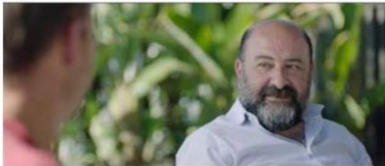
Pierre Bismuth, Where is Rocky II? , 2015.

Maybe it all starts in 2006, when a friend gives Bismuth a copy of a 1980 documentary on Ed Ruscha filmed by Geoffrey Haydon for the BBC's Seven Artists Series . The 28-minute film draws parallels between Ruscha's work and the Los Angeles landscape; documents Ruscha crafting a fake boulder, and films him taking it out into the desert.