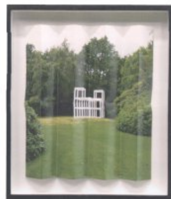
• Original (Color) (Sol LeWitt)