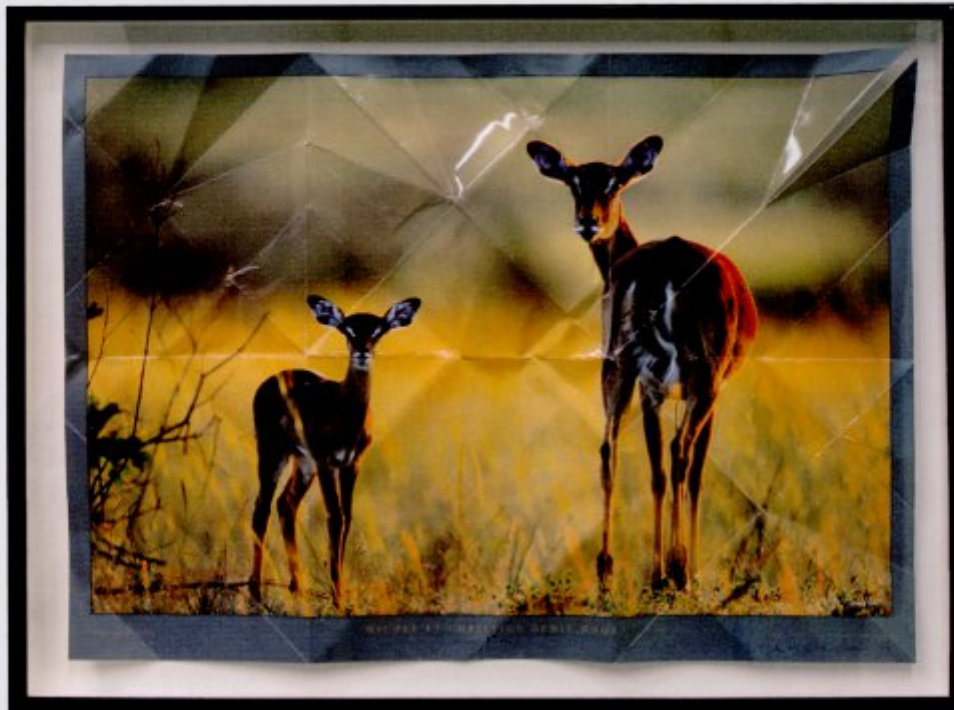
• Origami 'Tortue' (The Gazelles) 2003 Paper, ink, resin