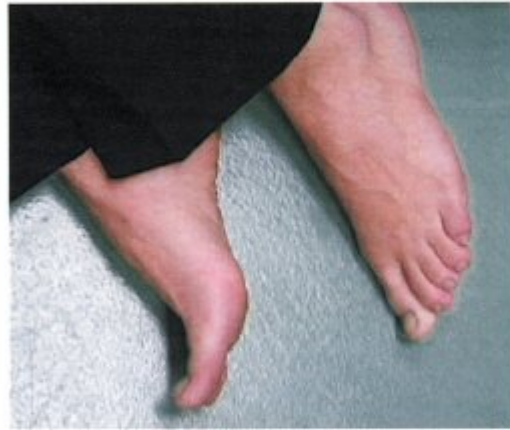
• D.E. 2003 / Video 061