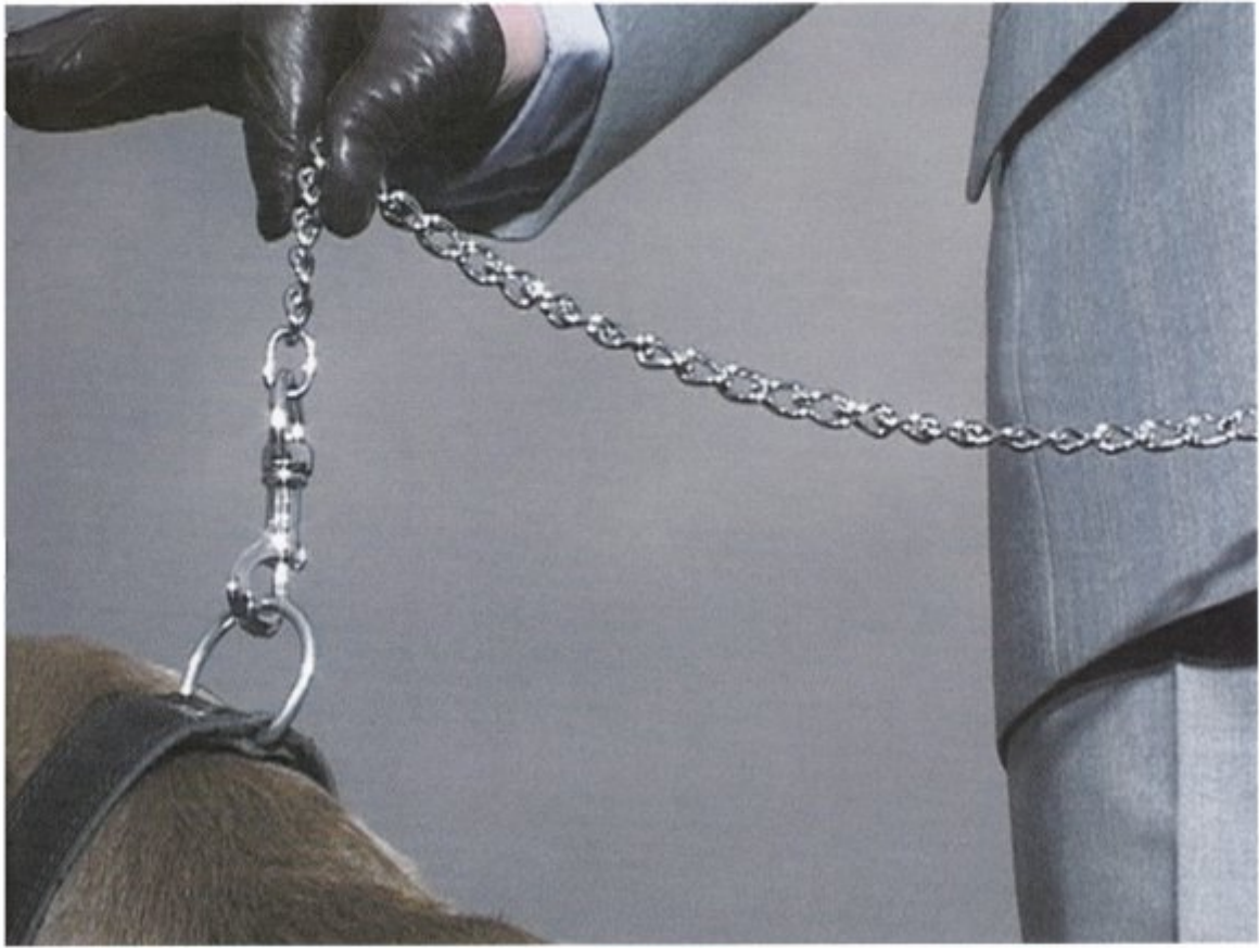
• Dog 2023 - Video 001