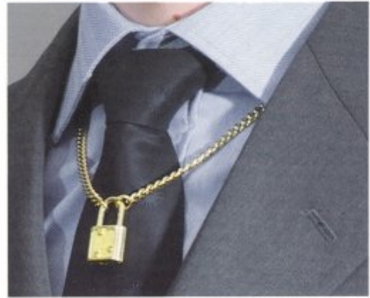
• Dog 2023 - Video 001