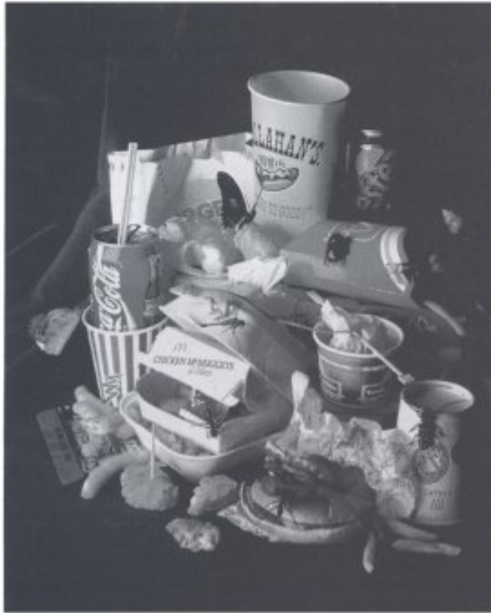
Nature Morte, 1994