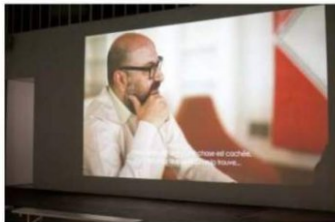
Pierre Blarubin, Where is Rocky II? , installation view, 2015.