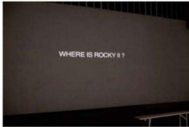
Pierre Blarubin, Where is Rocky II? , installation view, 2015.