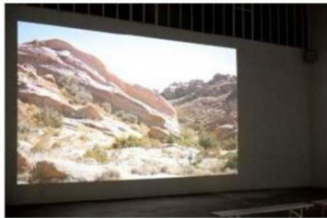
Pierre Blarubin, Where is Rocky II? , installation view, 2015. Courtesy of the artist and Bugada & Cargnel, Paris.