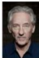
Ed Ruscha in London, 2010.

On a bright, clear day as the sun boils down, two figures pace around this impressive lump of granite in southern California, a camera crew following their every step. Overseeing the shoot is the French artist Pierre Bismuth, the man who came up with the original story for Eternal Sunshine of the Spotless Mind , Michel Gondry's dizzying tale of love, loss and memory. The 2004 film won the Frenchman a shared Oscar for best original screenplay, and he's now out at Giant Rock to shoot his debut feature film, a documentary of sorts entitled Where Is Rocky II? "I like to describe it as a fake fiction," he says.