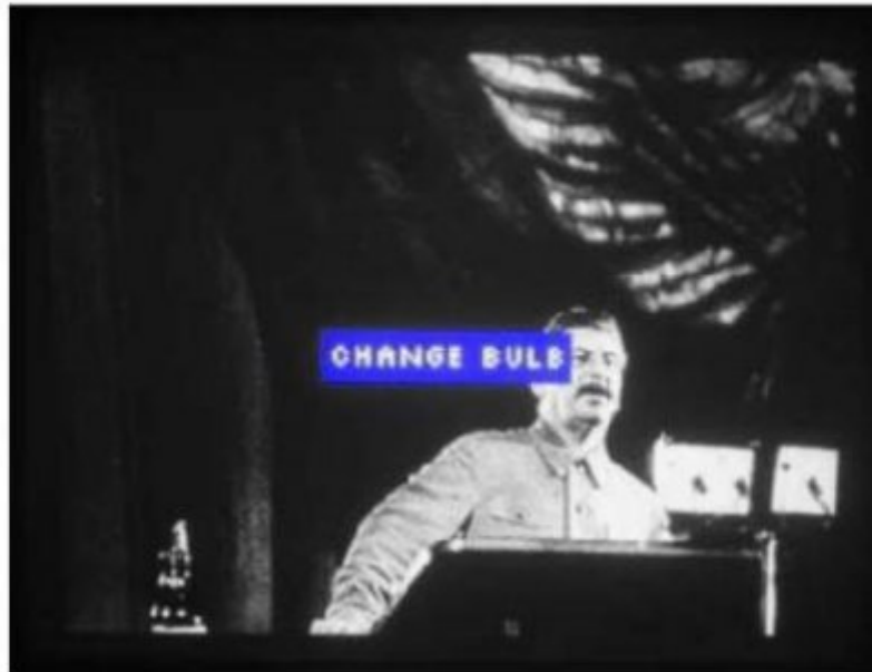
Pierre Bismuth & Cory Arcangel, Untitled, 2008. Courtesy of the artists and Bugada & Cargnel, Paris.

But maybe, it all actually starts in 2005, when Pierre Bismuth wins an Oscar for his original screenplay Eternal Sunshine of the Spotless Mind . As the Brussels-based artist recently told the Guardian , "With that thing in my hand, I realized it would be totally silly not to try to do something else in film, to capitalize on that success, because it was so unbelievable." And so began the hunt for Ruscha's rock.