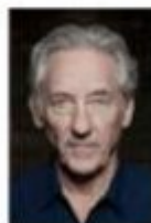
Ed Ruscha in London, 2010.

On a bright, clear day as the sun boils down, two figures pace around this impressive lump of granite in southern California, a camera crew following their every step. Overseeing the shoot is the French artist Pierre Bismuth, the man who came up with the original story for Eternal Sunshine of the Spotless Mind , Michel Gondry's dizzying tale of love, loss and memory. The 2004 film won the Frenchman a shared Oscar for best original screenplay, and he's now out at Giant Rock to shoot his debut feature film, a documentary of sorts entitled Where Is Rocky II? "I like to describe it as a fake fiction," he says.