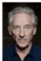
Ed Ruscha in London, 2010.