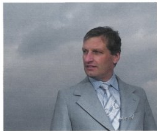
• Dog 2003 / Video 054