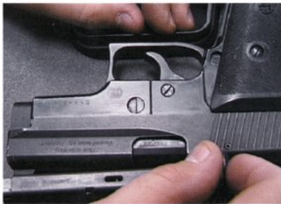
• DIE 2001 Video art