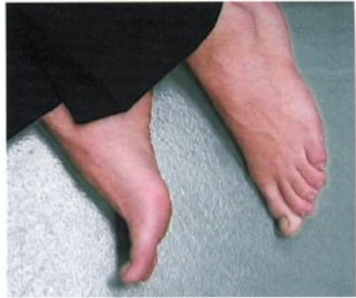
• D.E. 2003 / Video 061