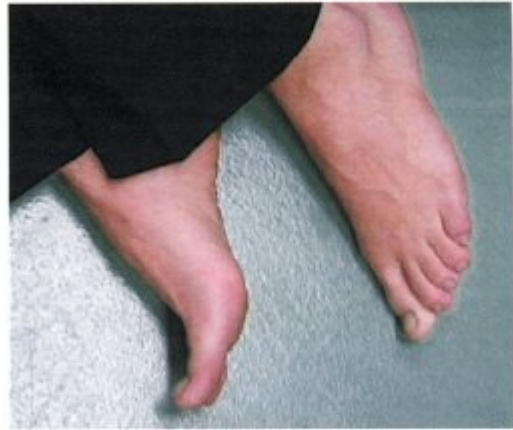
• D.E. 2003 / Video 061