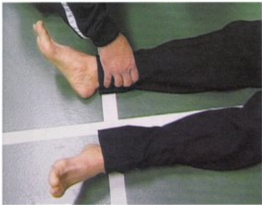
• D.L.E. 2020 - Video 001