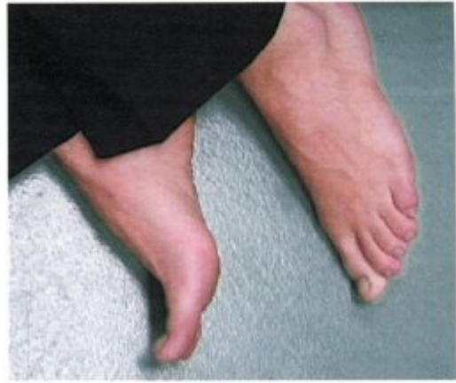
• D.E. 2003 / Video 061