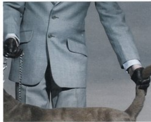
• Dog 2001 Video art

The videos all express a certain obsession – not only on the part of the actors, who are, without exception, masters of the introspective stare and enigmatic sidelong glance – but by the artist who, zooming in and then standing back, employs the camera as if it were a combination of microscope and mirror. In 40-15 (1999) the actors mime a game of tennis to a reflection of themselves, their actions duplicated and repeated in both an actual mirror and the mirror of the camera's lens. This is an image of lives lived as hyperreal experience – each shrug and twist exaggerated until, within all of this ambiguous activity,