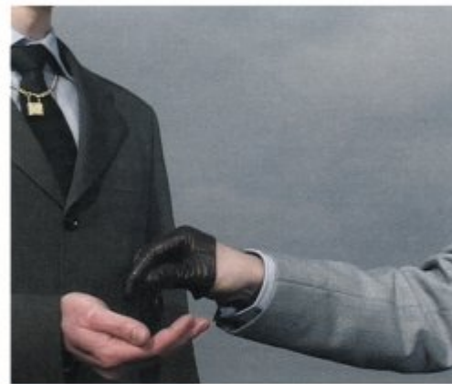
• Dog 2001 Video art